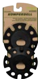
WINTER BASKET XL art. # 354-925