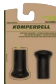
TIP PROTECTOR Ø 8 mm: art. # 192-925 Ø 12 mm: art. # 190-925