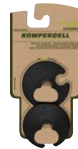
RACE BASKET XS art. # 379-925