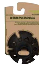
VARIO WINTER BASKET art. # 364-925