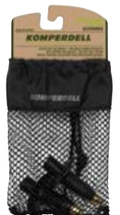
TRAIL TIP art. # 1016-925

Subject to all changes as well as misprints.