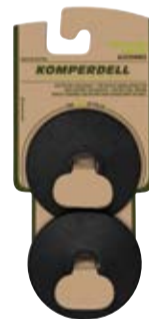
RACE BASKET art. # 352-925