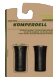
TIP PROTECTOR Ø 8 mm: art. # 162-925 Ø 12 mm: art. # 161-925