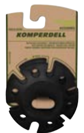
VARIO WINTERBASKET XL art. # 912-925