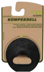
VARIO SUMMER BASKET art. # 356-925