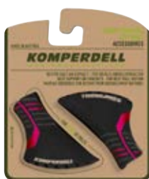
NORDIC WALKING PAD IN DIFFERENT DESIGNS AVAILABLE