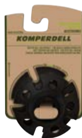
ICE-FLEX WINTER BASKET winter basket: art. # 396-925 winter basket XL: art. # 385-925