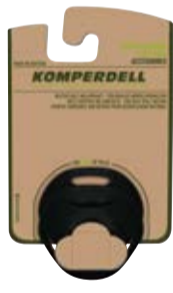
MINI UL BASKET art. # 943-925