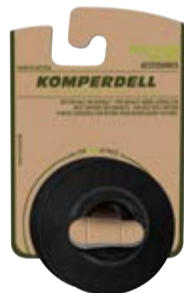
ICE-FLEX BASKET SUMMER art. # 397-925