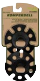
WINTER BASKET art. # 351-925