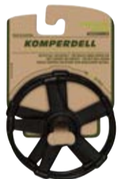
VARIO DEEP POWDER BASKET art. # 908-925